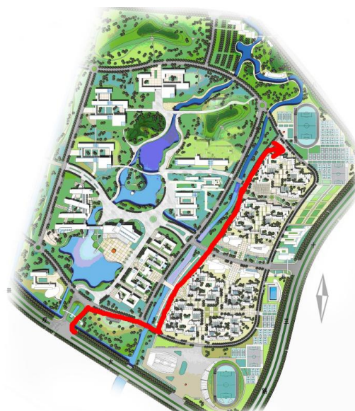
Right: The red cursor shows the path from south gate to the Hall