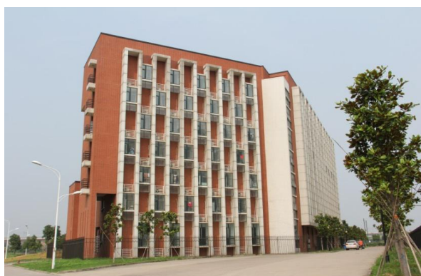
Above: International Hall G11