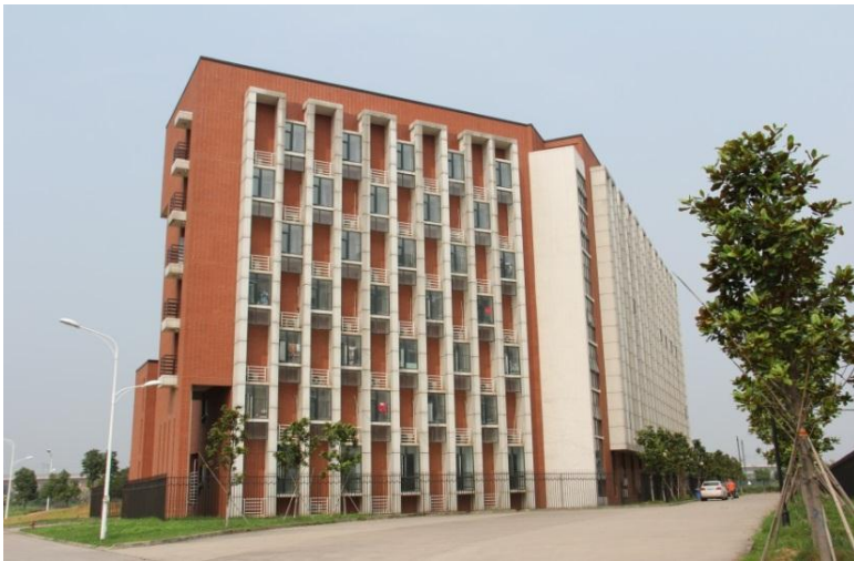
Above: International Hall and its location on Jiangning campus. The red cursor shows the path from south gate to the Hall